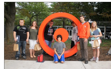
Summer Employment Program participants tour Corning Glass.

Participants then began their summer jobs, working throughout the region at area school districts, Martha Lloyd Community Services, the Bradford County Prothonotary Office, Bradford County Manor, The Creamery, TREHAB, Schneider's Market, Susquehanna Free Library, Mansfield Borough, Goodwill, Wyoming County Recycling Center, Endless Mountains Visitors Bureau, and Ebb's Candy Jar.